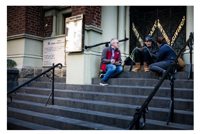
HHC GP and nurse talking with one of > 500 people sleeping rough in Perth during pandemic

"The social determinants of health underlie so many medical issues we see, and this has been exacerbated during the COVID-19 pandemic. Without addressing these social issues, they perpetuate the medical problems. By using an integrated model of a GP and support worker for home visits, and a team of GP, nurse and outreach worker on the streets, we are better able to address both the medical and social aspects of people's health, enabling better outcomes than if we addressed either separately."