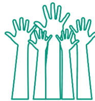
Passages Youth Engagement