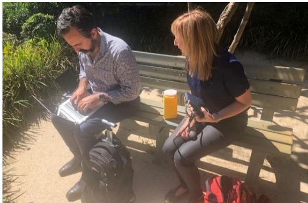
HODDS team equipped to work in any setting