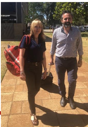
The HODDS Team